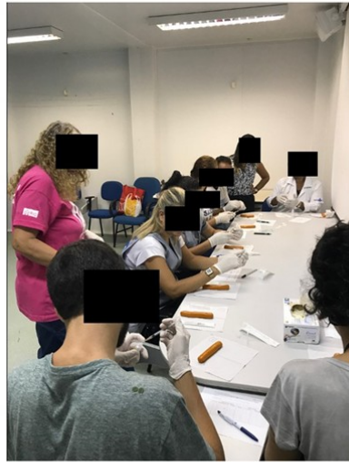
Figure S1A- Trainees in the practical session